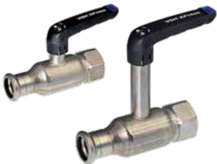
VSH XPress FullFlow Stainless ball valve (press x union nut)